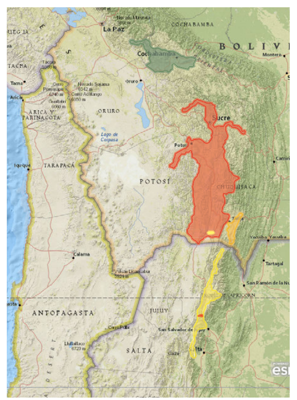
Map 1. Extent of occurrence of: Echinopsis ( Cleistocactus ) buchtienii (22 locations, dark green); Echinopsis ( Cleistocactus ) nothohyalacantha (123 locations in total), nothohyalacantha populations (20 locations, yellow), tarijensis populations (15 locations, orange) and tupizensis populations (88 locations, red)